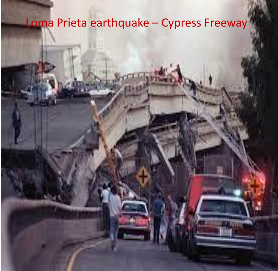
Loma Prieta earthquake – Cypress Freeway